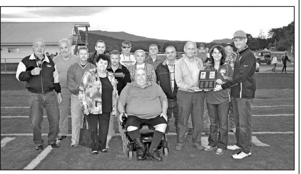
Here are several players from the very first Towns County High School Varsity football team, honored at the 2016 TCHS Homecoming game.

"Fall season is beautiful and we've started decorating. We want everyone to come out and enjoy it, get some good food and have a good time here at the Fairgrounds."